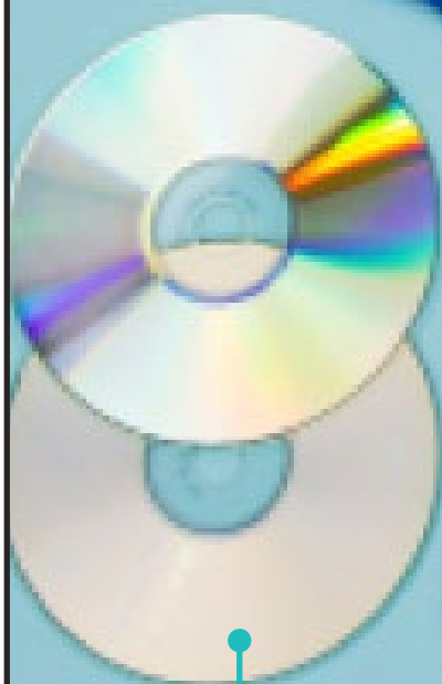
2 old CDs